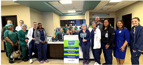
January 9, 2025 FORECAST: Finding and retaining employees